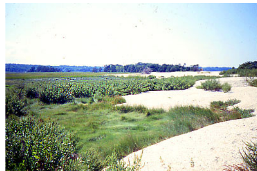
Figure 5-3. The Back Shore of the Barrier Beach at Flax Pond, NY

The upper limit of the backshore beach may also include perennial herbs dominated by seabeach sandwort and interspersed with sea rocket and beachgrass. This community assemblage is rare in Connecticut. This habitat is used for breeding by the northern diamondback terrapin ( Malaclemys terrapin ).