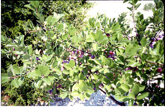
Figure 5-2. Beach Plum ( Prunus maritima ) Bearing Fruit

substrate. Herbaceous species include beach heather ( Hudsonia tomentosa ), seaside goldenrod, bearberry ( Arctostaphylos uva-ursi ), Cyperus ( Cyperus polystachyos var. macrostachyus ), beach pinweed ( Lechea maritima ), poison ivy ( Toxicodendron radicans ), and joint weed ( Polygonella articulata ). Typical shrub species landward of the primary dunes include beach plum ( Prunus maritima ) ( Figure 5-2 ) and bayberry ( Myrica pensylvanica ). Species diversity in dune plant communities generally increases as protection from salt spray increases. In Connecticut there is an unusual colony of beach plum known as Graves' beach plum, growing entirely as vegetative clones. This colony has been